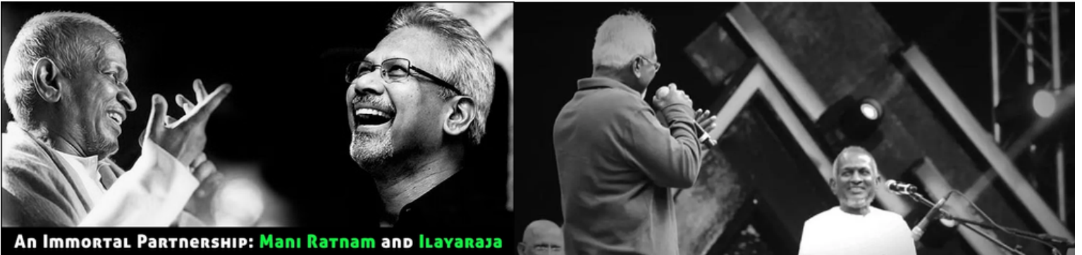
An Immortal Partnership: Mani Ratnam and Ilaiyaraaja